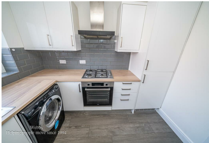
Webbs Helping people move since 1994