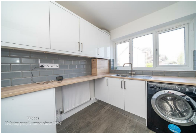
Webbs Helping people move since 1994