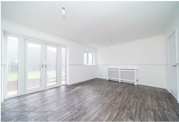
Webbs Helping people move since 1994