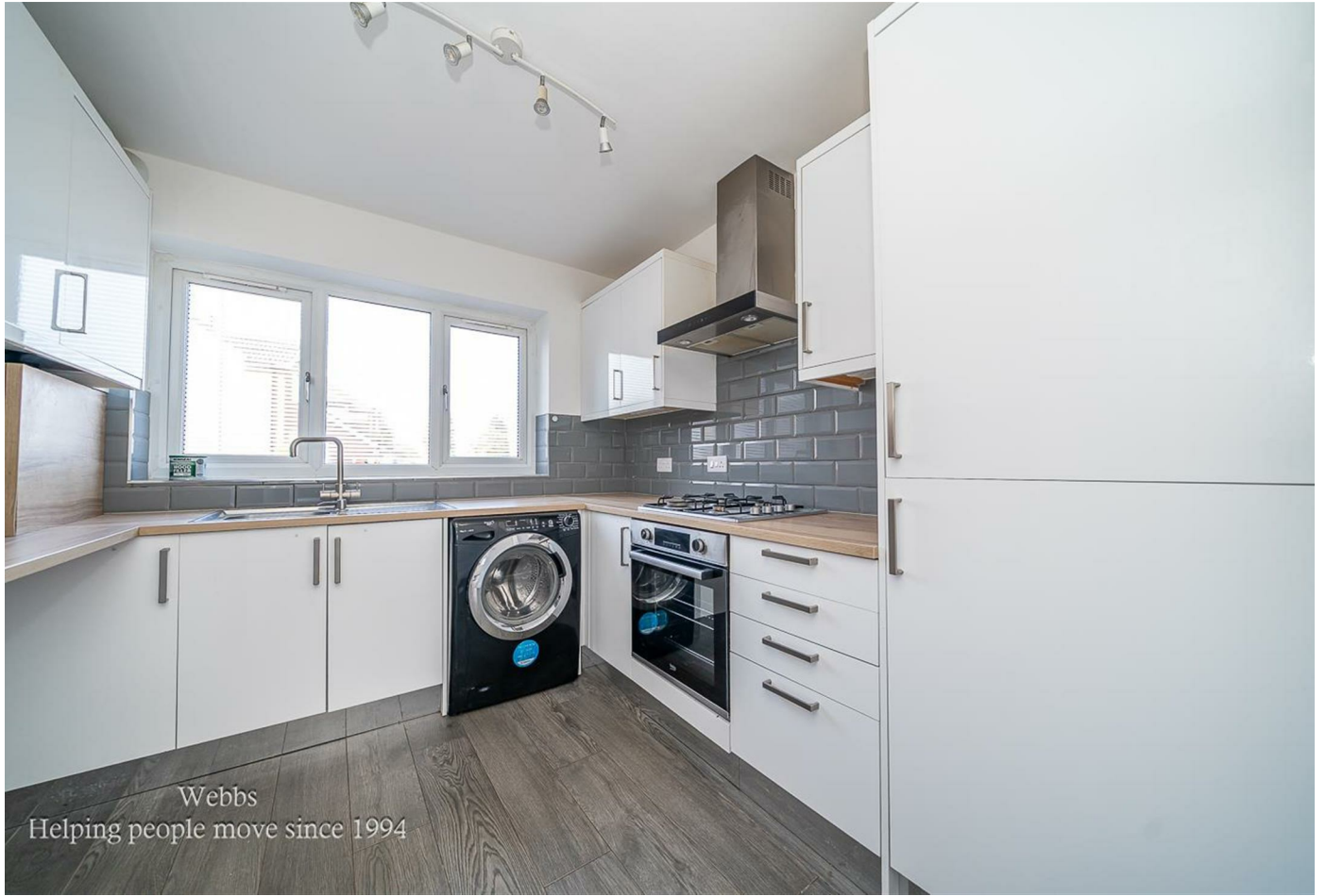
Webbs Helping people move since 1994