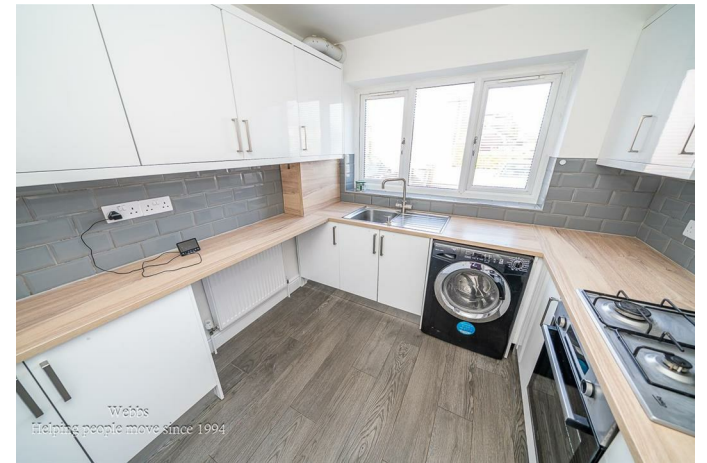
Webbs Helping people move since 1994