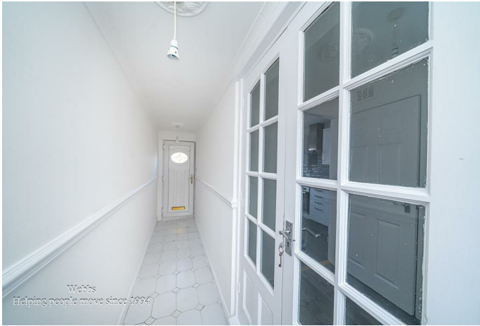
Webbs Helping people move since 1994